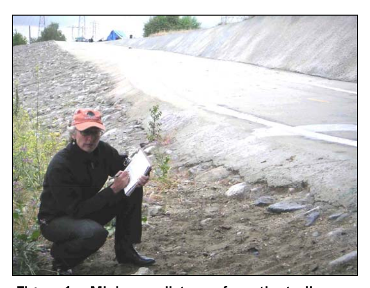
Figure 1 - Minimum distance from the trail

When you arrive at the designated trail segment, set yourself up in a position where you have a clear view of the trail, but where you will not obstruct trail users (see Fig. 1). Remember, we do not want to scare trail users or behave in such a way that they will alter their normal trail use activities. You MUST wear the volunteers USC clothing that we have provided to you, and carry your identification at all times. It is extremely important that you do not block, obstruct or otherwise interfere with trail users. We suggest that you position yourself at about 8 ft back from the trail where you will be visible to trail users, but will not hinder their use of the trail. You should take a fold out chair or blanket to sit on. You may also be required to carry some refreshments to offer trail users if they stop to inquire about what it is that you are doing.